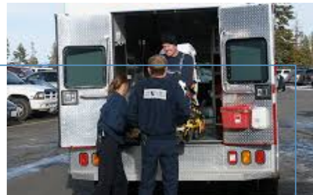
Prescriptive Medical Necessity for Patient Transfers