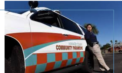
Providers of "mobile" healthcare