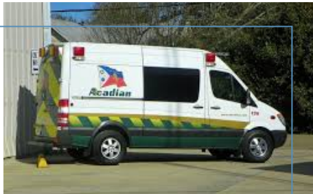
Stabilization & Accountability